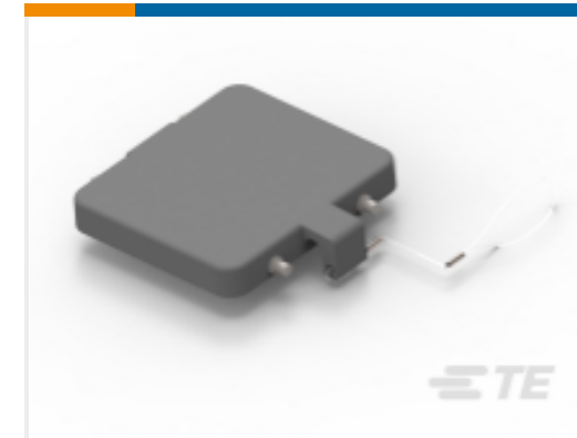
TE Part # T1000321320-000 H32B-KDBP-BOM