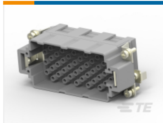
TE Part # T2050962101-007 HEEE-048-M 49-96