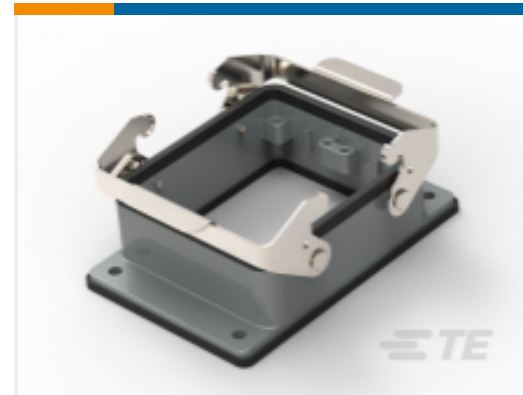
TE Part # T1410322000-000 H32B-AG