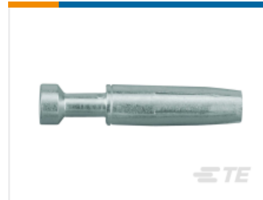
TE Part # T2030002040-000 CEF-4.0